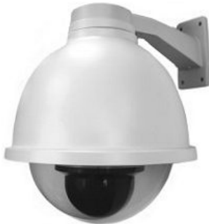
Standard Smoked Dome

With the range of modern electronics and software CCTV systems and camera's are becoming increasing small and yet very powerful.