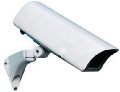
High Vandal Resistant